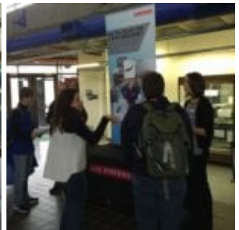
The 2015 Engineering Technology Career Opportunity Expo