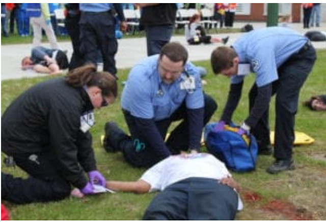
Scenes from the 2014 Mock Environmental Disaster drill