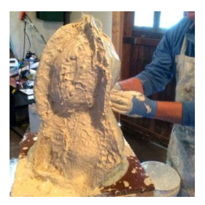
"Encasement mold nearing completion."