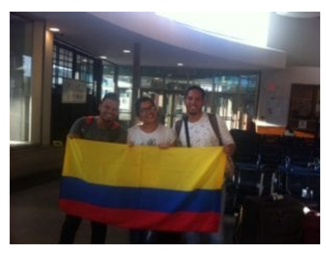
Colombian students in Fall 2015