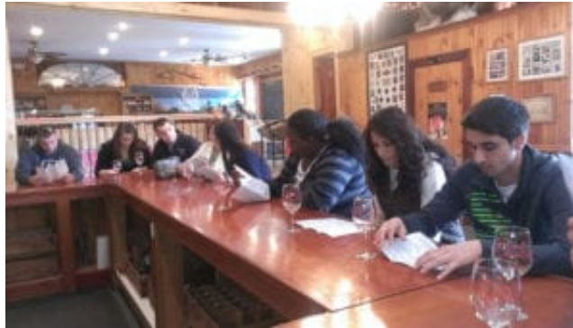
The tasting room at Hazlitt Vineyards.

discusses the “Angels Share”, that portion of wine lost through absorption into the barrel or atmosphere that has to be replaced to avoid contact of wine with oxygen.