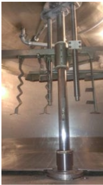
A peek inside the settling/filtration tank at Wagner Brewing.