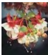
Swing Time (item #17)

Gorgeous fully double hanging flowers that bloom all summer. Bright-diffused light out of direct sunlight.