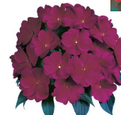
Red (item #2)