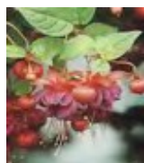
Dark Eyes (item #16)