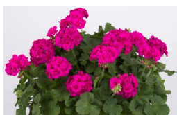
Violet (item #14)

Award winning cross of ivy and zonal geranium. Offers the bloom of a zonal geranium plus the mounded/semi-trailing ivy geranium foliage. EXCELLENT heat resistance. Thrives in hanging baskets.