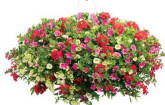
Mixed Color Calibrachoa Baskets Many Striking Combos Growers Choice (item #7)