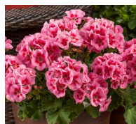
Pink Flame (item #15)