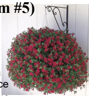
Red (item #5)

Greatly improved over million bells, These Proven Winner Brand Calibrachoa Have superior summer full sun performance that truly make them SUPER!