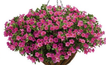
Pink (item #6)