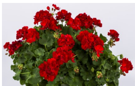
Red (item #13)