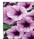
Plum (item #11)

We also offer Mixed Color Petunia Baskets Many Striking Combos Growers Choice (item #12)