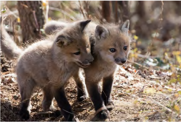
Red fox kits.

A family of foxes has recently taken up residence under the Business Building gazebo.