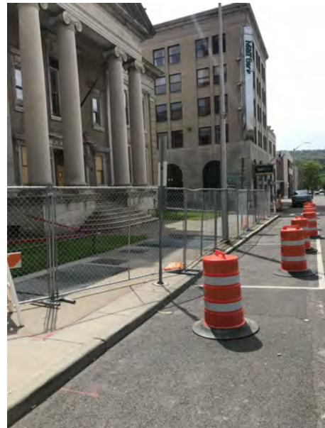
Work has begun at the former Carnegie Library site in Binghamton.