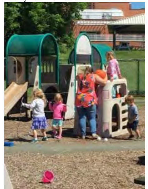
Children play outdoors at BC Center