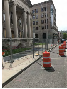
Work has begun at the former Carnegie Library site in Binghamton.