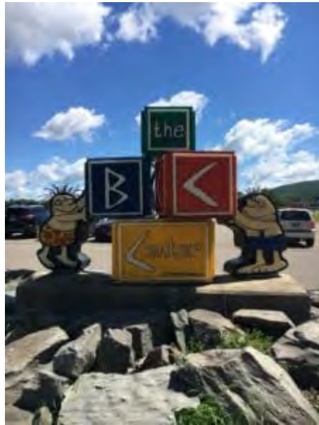
The BC Center provides affordable childcare for student parents, as well as faculty, staff and community members.