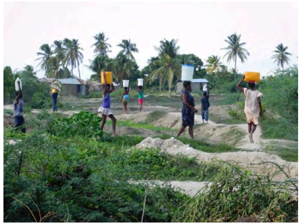
Residents of Grande Saline carrying water