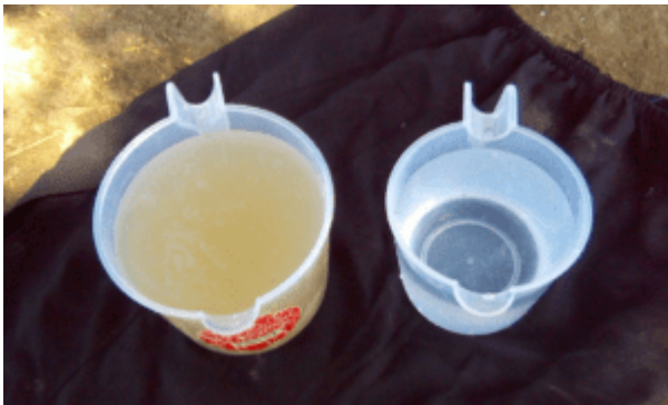
Filtered water versus unfiltered water in Grande Saline

Last week, more than 14,400 gallons of safe drinking