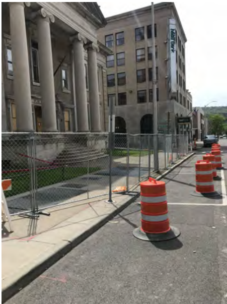
Work has begun at the former Carnegie Library site in Binghamton.