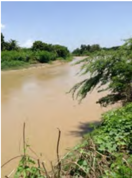
Water source in Grande Saline.