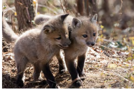
Red fox kits.