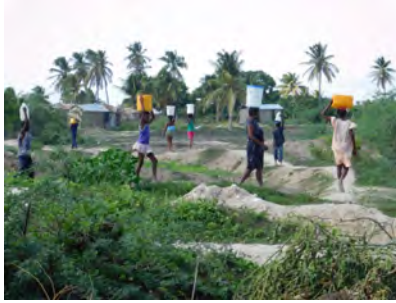
Residents of Grande Saline carrying water