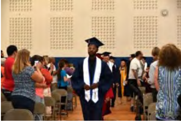
P-Tech students process at the start of their graduation ceremony.