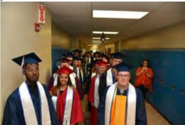
P-Tech students line up for their graduation ceremony.

The six-year program supports students in earning both their high school diploma and associate's degree from SUNY Broome in health science, computer technology or engineering technology. Students are also supported by industry partners, who provide mentorship, guidance and workplace learning during the six years.