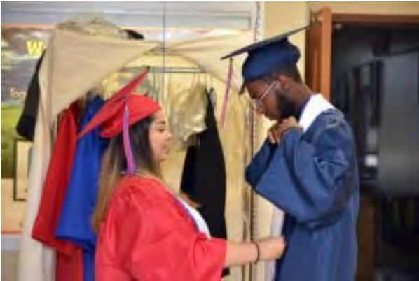
P-Tech students prepare for their June 13 graduation ceremony.