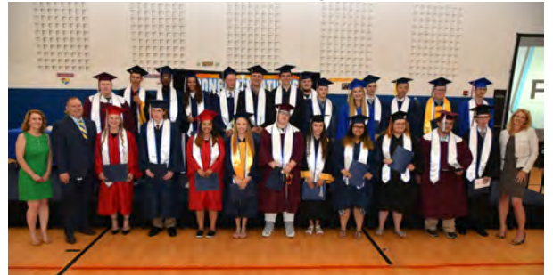
The inaugural Southern Tier P-Tech class is now graduating from high school.

Click here for more photos of the event at Broome-Tioga