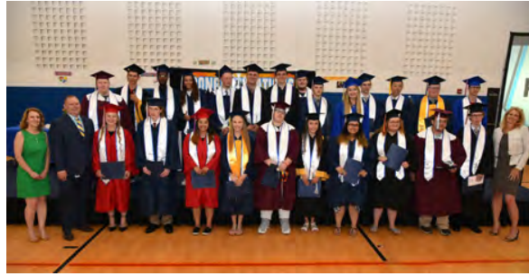
The inaugural Southern Tier P-Tech class is now graduating from high school.